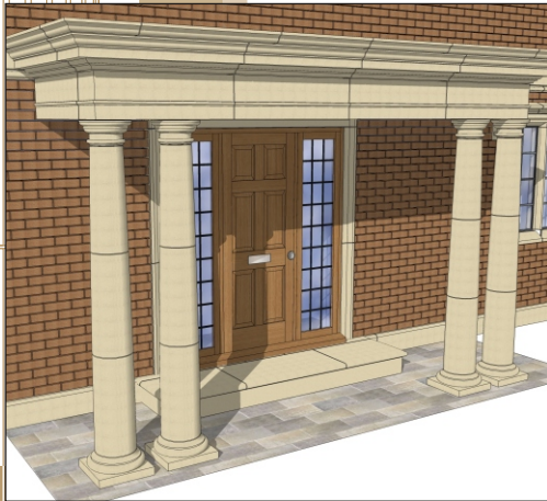
Typical installation detail

All our columns can have their overall height increased with a riser, or decreased with a slight modification.